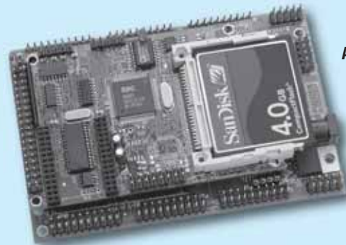
A CAN-Engine™ installed on the top of a P100 board.

The CANE can be powered by regulated 5V DC or unregulated 9-12V DC with installing a 5V regulator. The CANE works with TERN expansion boards including the P52, P100 and MotionC.