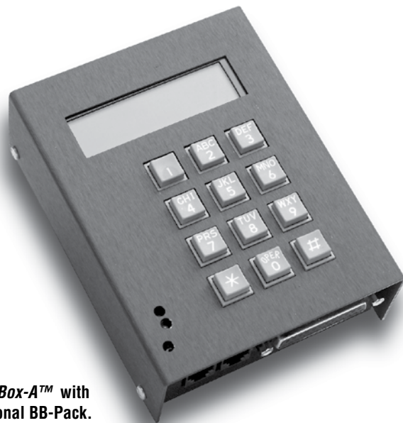
BirdBox-A™ with optional BB-Pack.

a 16x2 LCD, a 3x4 keypad, a beeper, and an enclosure. An optional switching regulator can be installed to reduce power consumption. A MemCard™ (MM-B) can be installed without using the BB-Pack. Up to 250 BB-A s can be networked via RS-485.