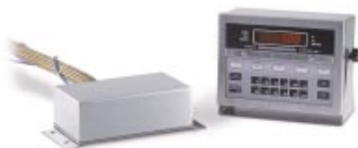
The IQ 700 IS shown with intrinsically-safe power supply.

In dangerously-explosive and dimly-lit environments, the FM-approved intrinsically-safe IQ 700 IS shines as the new indicator of choice. From the