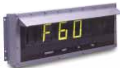
SURVIVOR F60 shown with optional visor