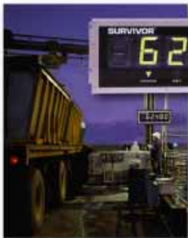
SURVIVOR F60 shown with backlight option