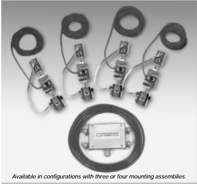
Available in configurations with three or four mounting assemblies.

The ITCM Series utilizes several Rice Lake Weighing Systems components to provide an unmatched level of performance in tank and hopper weighing applications and mechanical scale conversions. The ITCM HE incorporates clevis and unique rod end ball joint assemblies to reduce the overall length to less than half of the traditional tension cell mounts, while providing correct load alignment. In addition, the load cell is completely electrically isolated* from stray currents, which are a major cause of load cell failure. To complete the design, a bonding strap connects the two clevis assemblies to further provide safety to your load cells.