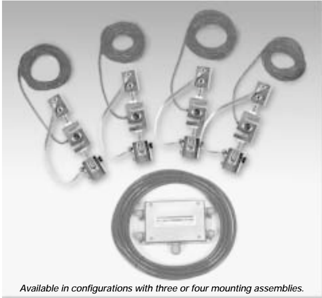
Available in configurations with three or four mounting assemblies.

The ITCM Series utilizes several Rice Lake Weighing Systems components to provide an unmatched level of performance in tank and hopper weighing applications and mechanical scale conversions. The ITCM HE incorporates clevis and unique rod end ball joint assemblies to reduce the overall length to less than half of the traditional tension cell mounts, while providing correct load alignment. In addition, the load cell is completely electrically isolated* from stray currents, which are a major cause of load cell failure. To complete the design, a bonding strap connects the two clevis assemblies to further provide safety to your load cells.