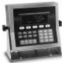
Sloped face model shown