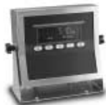
Sloped face model shown