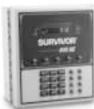
IQ plus 810HE