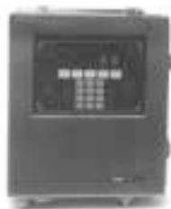
IQ plus 810SS