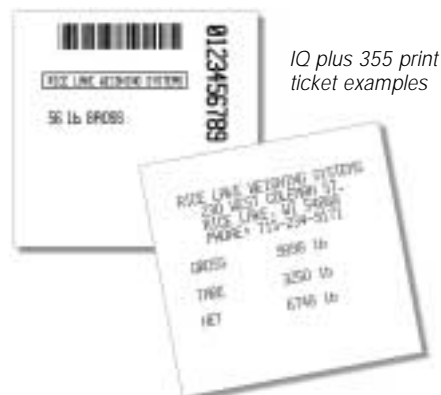
IQ plus 355 print ticket examples