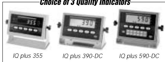
IQ plus 355