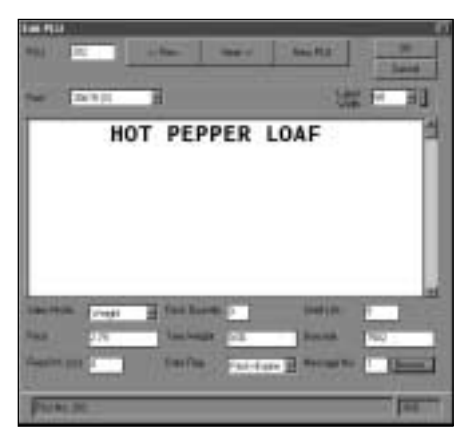
PLU Entry Screen