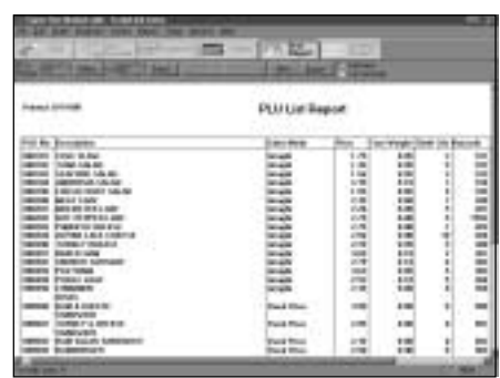
Preview PLU List Report Before Printing