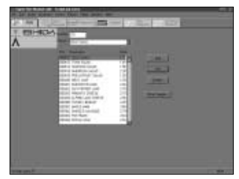
PLU Search Screen