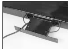
Fully-enclosed junction box and slide-out tray provide superior protection and quick access.