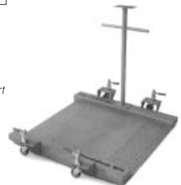
BPS-D1K stainless steel, portable, scale-mounted indicator stand with transport grips shown at right.