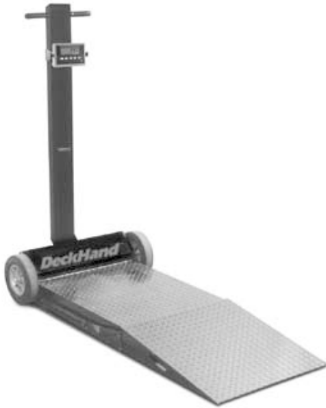
Shown with optional ramp. Indicator sold separately; shown for illustration only.